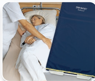
SAMARIT Rollbord H-Line