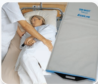
SAMARIT Rollbord ECOLite