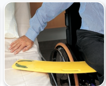
SAMARIT Nursing Aids

Download your language from our website or ask your local distributor.